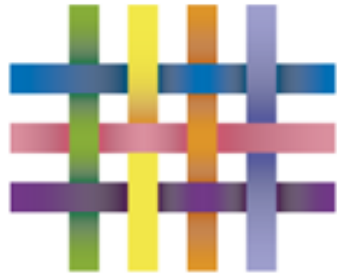
Tapestry Online Learning Journey